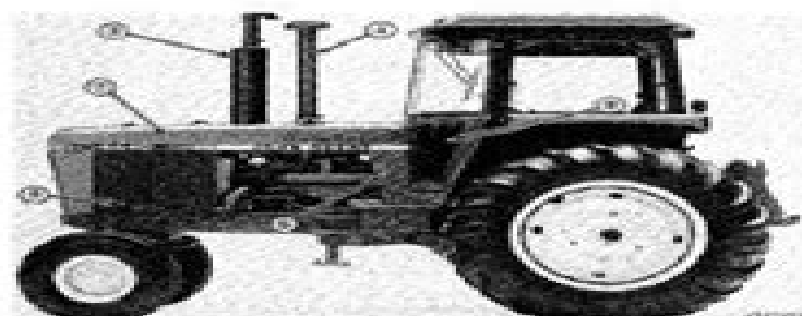
Fig. 13-Removing Muffler, Screens and Cowling