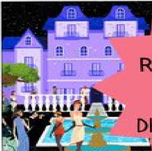
Party at Gatsby's West Egg!

TWO READING GUIDES INCLUDED FOR DIFFERENTIATION!