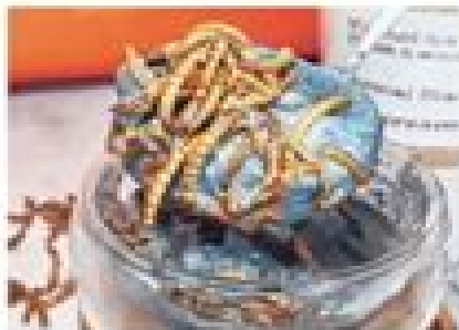
Dried malachows paired with Creamer's new Charcoal Black Tiramisu ice cream.

For a limited period, Creamer is offering these insects as optional toppings ($10 each) to pair with its ice cream flavours ($4.90 to