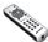
Remote control with 2 AAA batteries