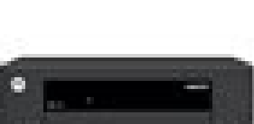
IP set-top box

The following material should be present in your package.