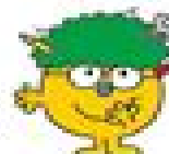
36 Little Miss Inventor