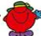
17 Little Miss Scatterbrain