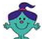
37 Little Miss Brave