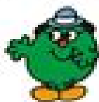
3 Little Miss Neat