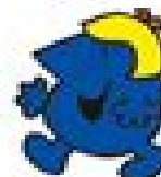
25 Little Miss Brainy