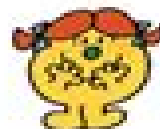
6 Little Miss Trouble