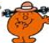
24 Little Miss Fickle