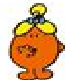
27 Little Miss Curious