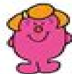
21 Little Miss Wise