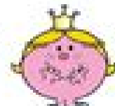
34 Little Miss Princess