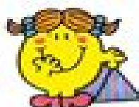
22 Little Miss Tidy