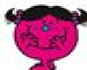
32 Little Miss Bad