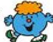
18 Little Miss Star