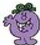
2 Little Miss Naughty