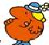
23 Little Miss Greedy