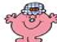
16 Little Miss Lucky