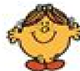
9 Little Miss Magic