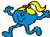
30 Little Miss Somersault