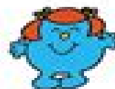
7 Little Miss Giggles