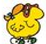
19 Little Miss Busy