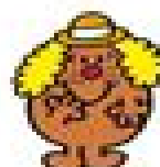
14 Little Miss Dotty