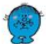
10 Little Miss Shy