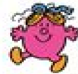
20 Little Miss Quick