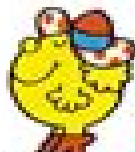
11 Little Miss Splendid