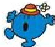
1 Little Miss Bossy