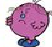
26 Little Miss Stubborn