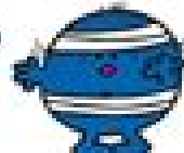
33 Little Miss Whoops