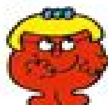
29 Little Miss Contrary