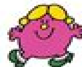
8 Little Miss Helpful