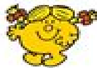
4 Little Miss Sunshine