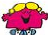
13 Little Miss Chatterbox