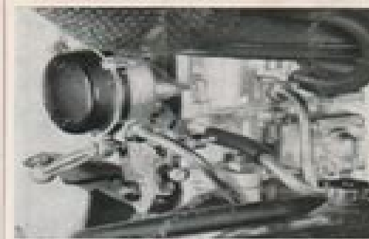
A VOILE DE DÉPART AUTOMATIQUE ET POMPE DE REPRISE