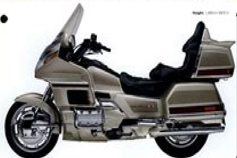
Length: 2,100mm (82.7")

A 1500 gives a large, a fast and an ultimate all-weather ride. The Gold Wing packs the advanced features and carefully engineered components needed to make a superior, all-weather bike.