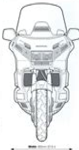
Wheelbase: 1,600mm (62.9")