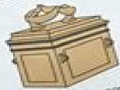
Ark of the Covenant