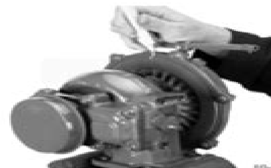
Figure 2.10 Mark Compressor/Backplate Location