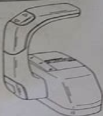
COMMANDER 3000 SINGLE HANDLE CONSOLE MOUNT REMOTE CONTROL