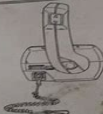
COMMANDER 3000 PANEL MOUNT REMOTE CONTROL