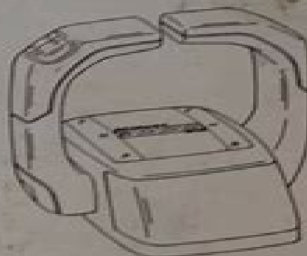
COMMANDER 3000 DUAL HANDLE CONSOLE MOUNT REMOTE CONTROL