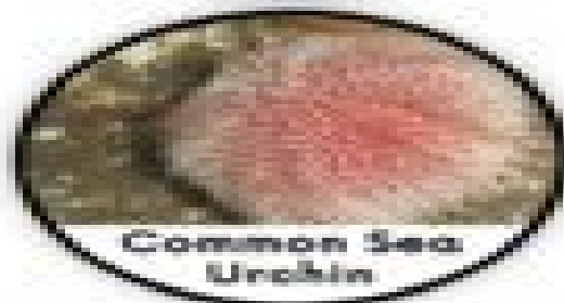
Common Sea Urchin