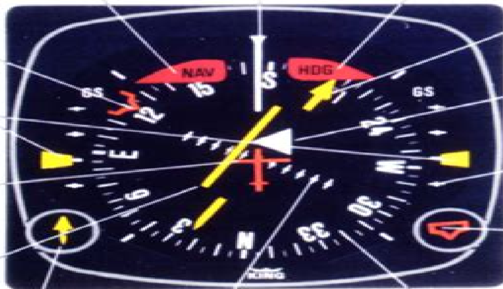
Heading Select Knob