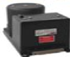
Compass Warning Flag