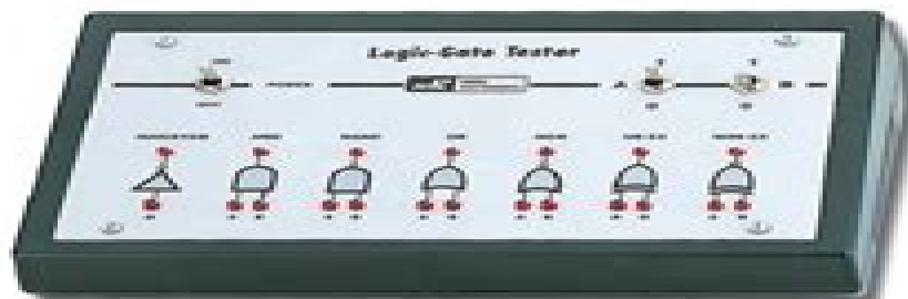
Figure 602 : Vous vous rendrez vite compte de l'utilité de cette table de vérité électronique, car elle vous permettra de savoir instantanément quel niveau logique sera présent sur la sortie d'une porte, simplement en modifiant les niveaux logiques sur les entrées.

port, car il n'est pas rare qu'une broche sorte à l'extérieur ou bien qu'elle se replie vers l'intérieur. En utilisant de petits morceaux de fil gainé, soudez les broches des inverseurs S1, S2 et S3 sur les pistes du circuit imprimé, comme indiqué sur la figure 598.