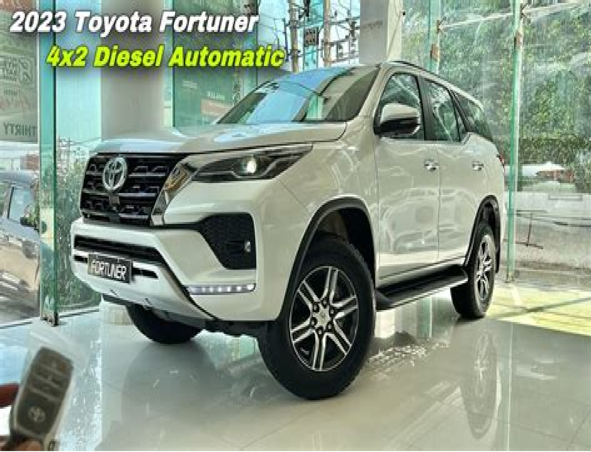
2023 Toyota Fortuner 4x2 Diesel Automatic