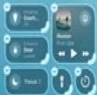
Control Center customization