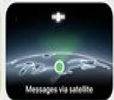
Messages via satellite