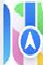
Larger icons on Home Screen