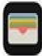
Installments & Rewards in Wallet