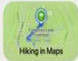
Hiking in Maps