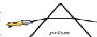
Concave laser lights refract, but don't ever spread out in a prism.

Lasers give off light of one particular wavelength. This comes from forcing a substance (usually a gas) to give off light. This light bounces back and forth between mirrors, causing other atoms to give off more light. When the light is powerful enough it escapes as a laser beam.