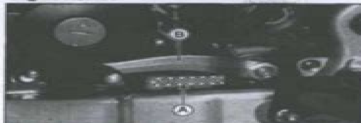
[A] Engine Number [B] S&T Medal