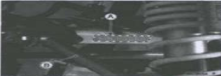
[A] Frame Number [B] Left Suspension Arm