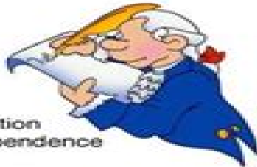
Declaration of Independence 1776