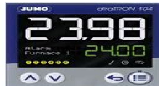
diraTRON 104 / type 702114

The devices can be conveniently configured using a PC with the help of the setup program (incl. program editor and ST editor). No separate voltage supply is required when configuring via the USB interface (USB-powered).