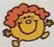
Madame EN RETARD