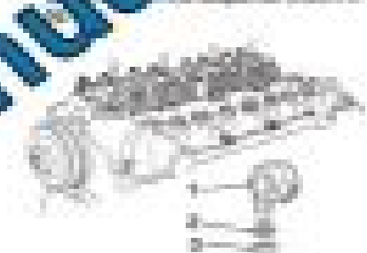
Fig. 4 Rocker shaft oil supply under

20. Fit the rocker shaft in the engine in the sequence shown.