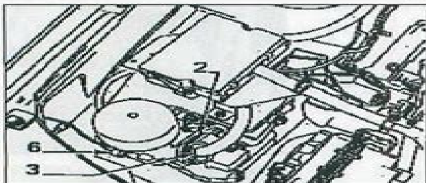
Purga del circuito de frenos. 2. Grupo electrobomba - 3. Tubo de baja presión - 6. Tornillo de expansión del grupo electrobomba.