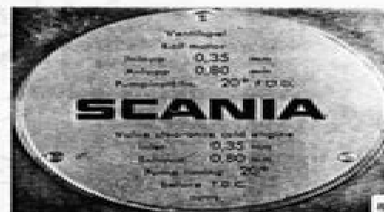
Fig. 11. Placa en la tapa de las válvulas

Una placa especificando el juego de las válvulas y los ajustes de la bomba de inyección se encuentra en la tapa de las válvulas.