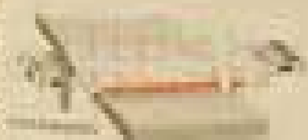
Step 9: Draw the third circle.