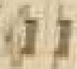
Step 8: Draw the second circle.

8 Using the compass, draw a circle with the same radius as the one in step 7. This circle will be the same size as the one in step 7.