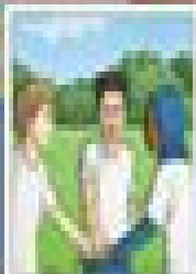
Share and Communicate

1 What is meant by that? How do you share and communicating during a game?