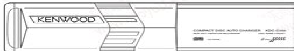
Illustration is KDC-C669/Y.