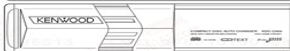
Illustration is KDC-C469FM/FMA.