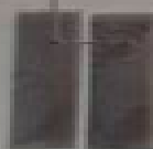
Metallic cabinet (A01-2591-000)