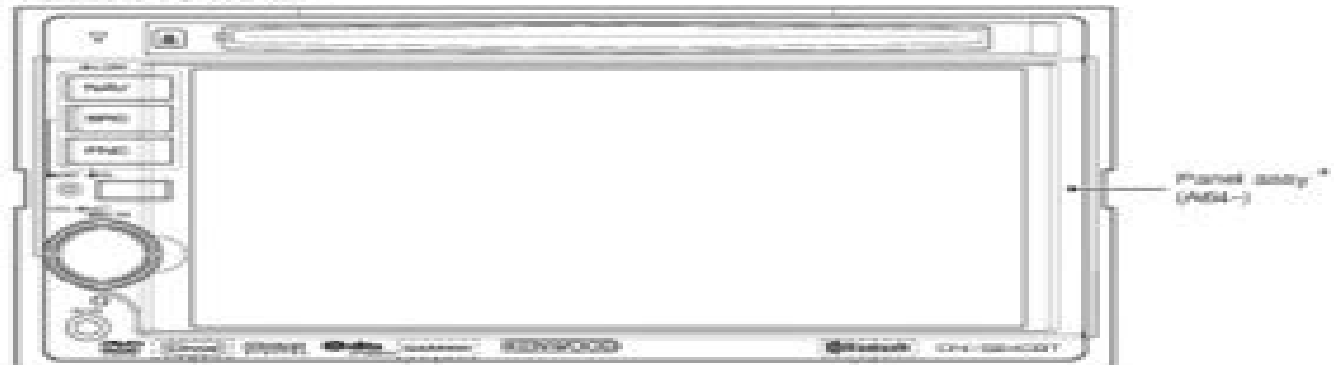
Illustration is DDX5240BT

© 2006-11 PRINTED IN JAPAN B53-0693-00 (N) 429