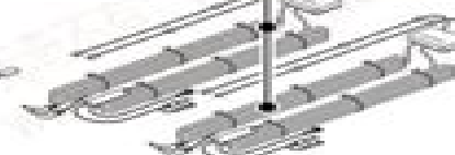
Cord with connector (E30-4953-05)