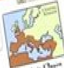
Le monde à l'époque

Le territoire de la première grande civilisation à l'ouest de l'Europe s'étendait de l'Espagne à l'Italie. Elle était peuplée de nombreux peuples différents.