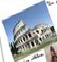
Les vestiges de l'empire