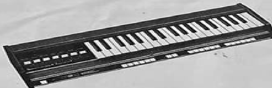
Satellite Model 5330