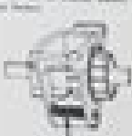
Position 3 Soybeans, Alfalfa, Timothy, etc.

To drill large size seeds, set the feed gate as shown.