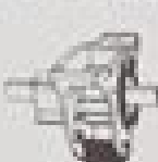
Position 4 Flax, etc.

To drill flax and other small seeds, set the feed gate as shown.