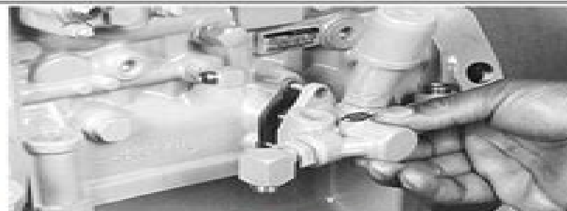
Removing Fuel Supply Pump