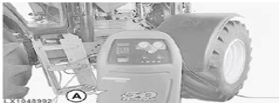
LX1048992 LX1048992-UN: JDG10974EU