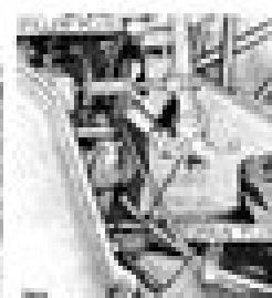
Cranking Engine Transmission Oil Plug