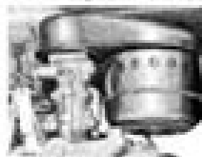
Figure 10-4-6—Adding Battery Specific Gravity

Specific gravity should not go below 1.275 which is half charge. When fully charged the reading will be 1.285 to 1.315.