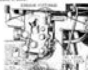
Figure 10-4-8—Fuel Tank Vent and Oil Level Check

If the tractor is equipped with Power Fuel, open the oil level vent (Figure 10-4-8) and see if it can be closed. If it can be closed, add good clean SAE 10 or 10-W oil until it can.