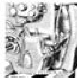
Figure 10-4-10—Power Shaft Clutch Housing Filler Plug

If the tractor is equipped with an engine driven "low" power shaft, check the oil level in the shaft by inserting the filler plug (Figure 10-4-10). Oil level should be up to level of bottom thread in filler opening. If it is not, add good clean SAE 10-W oil until its level is correct.