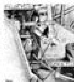
Cracking Engine Transmission Oil Plug