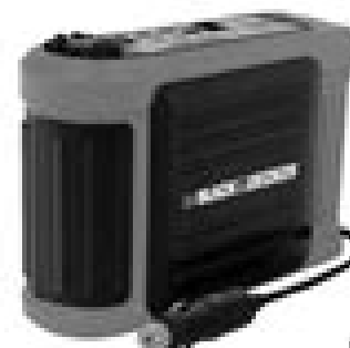
Catalog Number BB7B

Thank you for choosing Black & Decker! Go to www.BlackandDecker.com/NewOwner to register your new product.