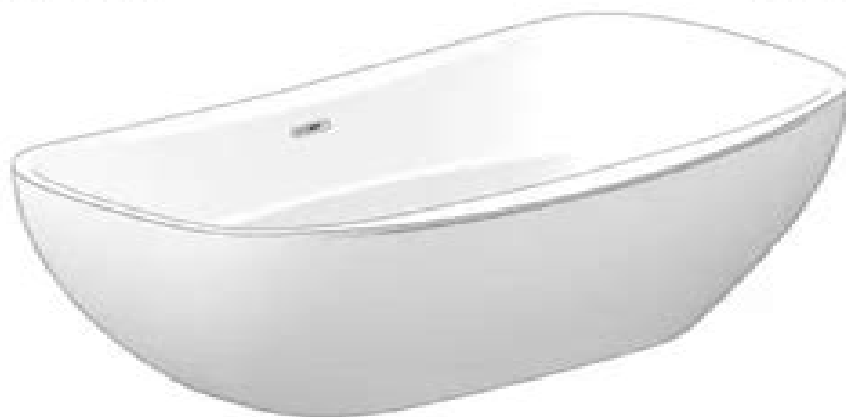
LIBRA STELLA 7038