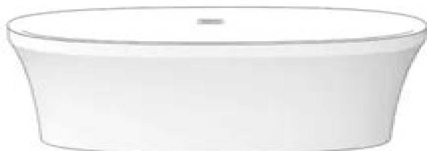
LIBRA AURORA 6634