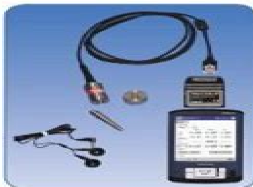
The SKF MicroVibe P System

A handy "quick-check" solution, based on the universal PDA platform, MicroVibe P is simple to use. Built-in automatic functions virtually eliminate set-up, while the analytical displays and automatic judgment of machine vibration readings help users identify machine problems on the spot!