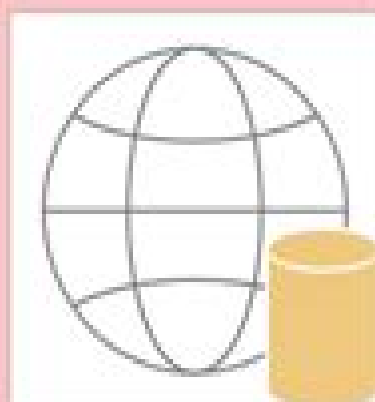
Application web personnalisée