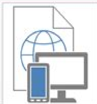
Suivi des biens