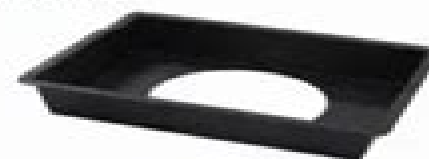
AZ002066 Charcoal Pan