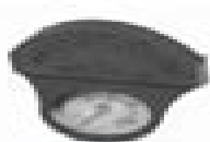
AZ002130 Temperature Gauge