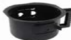
AZ002068 Ash Holder