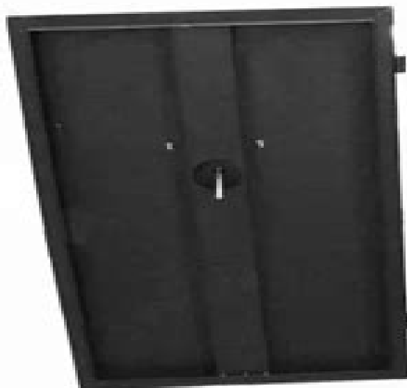
AZ002108 Door Panel