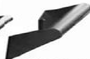
AZ002122 Side Handle