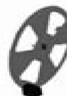
AZ002129 Damper Vent with Plastic Tip Guard