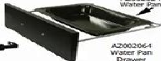
AZ002024 Water Pan