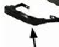
AZ002076 Nylon Plastic drawer handles