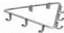
AZ002001 Meat hanger