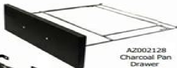
AZ002128 Charcoal Pan Drawer