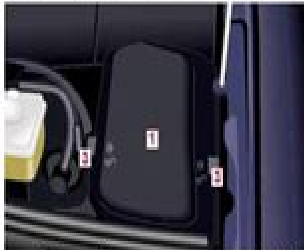
1 - Fuse box in engine compartment, left-hand side 3 - Tabs