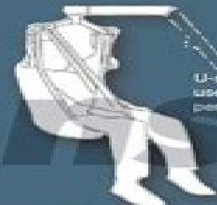
U-sling being used by a person