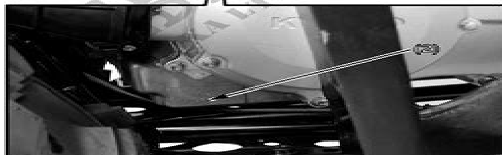
(2) Location of Engine Serial Number