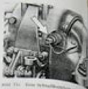
Abb. 154. Einzel-Ischschreibung des Ventils