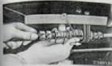
Abb. 155. Einzel-Ischschreibung des Ventils

Abb. 156. Einzel-Ischschreibung des Ventils