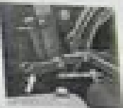
Abb. 158. Einzel-Ischschreibung des Ventils

Abb. 159. Einzel-Ischschreibung des Ventils