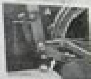
Abb. 157. Einzel-Ischschreibung des Ventils

Abb. 156. Einzel-Ischschreibung des Ventils