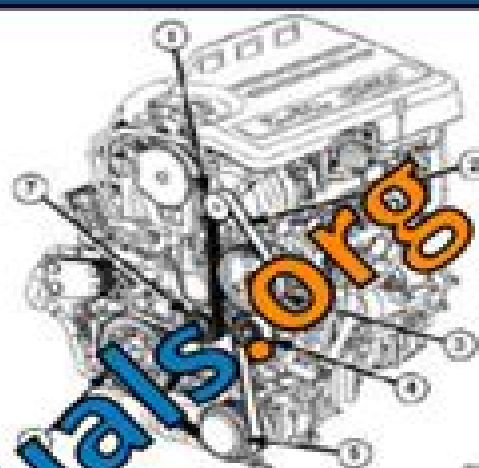
Fig. 24: Accessory Drive Belt Routing - 1.8L Diesel