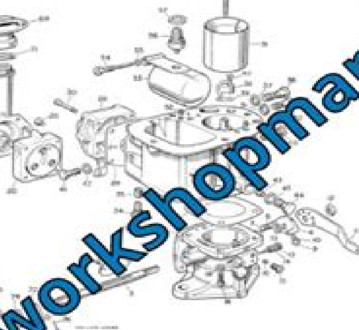
Fig. A-13—Assembly of components to first piston