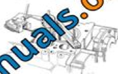
Fig. A-15—Checking cylinder bore extension

A small hole is drilled through the block into the middle groove to provide evidence of instant leakage past the ring.