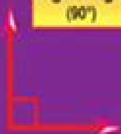
Right Angle (90°)