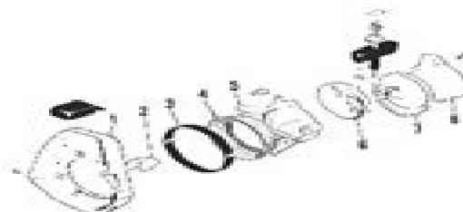
Fig. MC5-27—Exploded view of rewind starter used on Models GP125, SP125, SP125C, PM105 and SP105.

REWIND STARTER. Refer to Figs. MC5-21, MC5-26, MC5-27 or MC5-28 for exploded view of typical rewind starters. Rewind spring is coiled in housing in counter-clockwise direction on models shown in Figs. MC5-26 and MC5-27 and in clockwise direction on models shown in Fig. MC5-21 and MC5-28. Wind rope on pulley so pulley will properly engage inner end of rewind spring when rope is pulled.